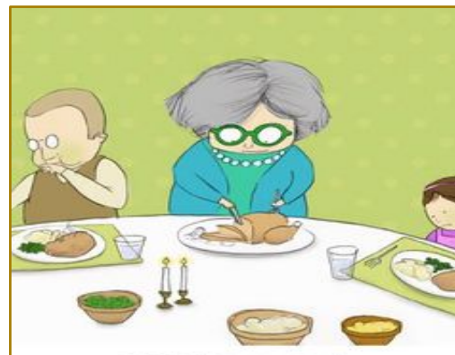
The Bobbin’s find out that quilt betting is a poor substitute for turkey stuffing.

The new officers will begin at the January 2020 meeting.